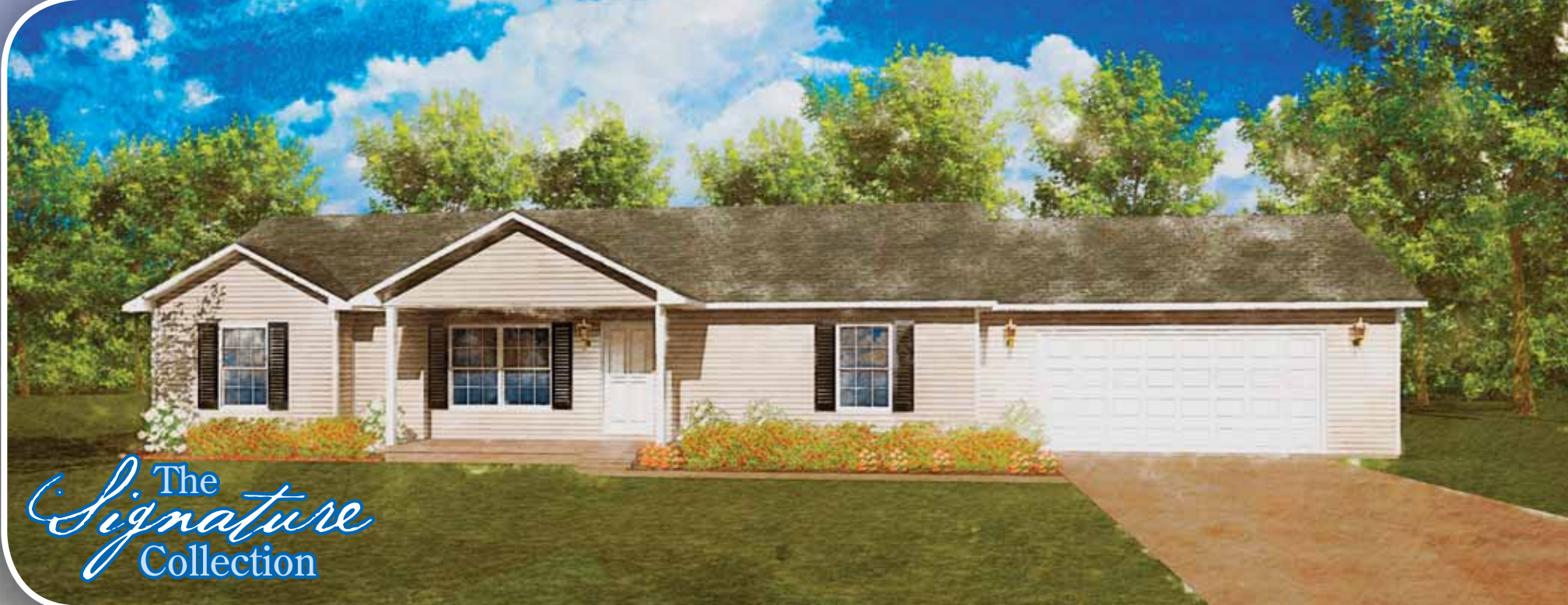
Optional Front Elevation